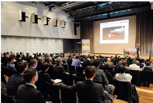
Picture 1: Insiders' meeting: 250 turbine manufacturing experts from around the world met in Aachen at the 4 th ICTM Conference.