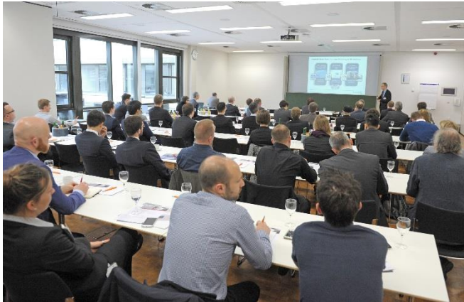
Image 3: From the 12 th to the 13 th of September, experts from all over the world will meet for the third time in Aachen for the "Conference on Laser Polishing – LaP".