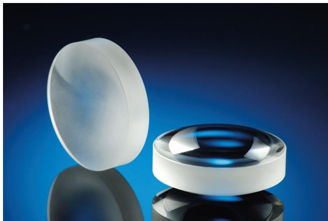
Image 1: The LBF process is particularly suitable for the correction of non-spherical optics in small to medium quantities.