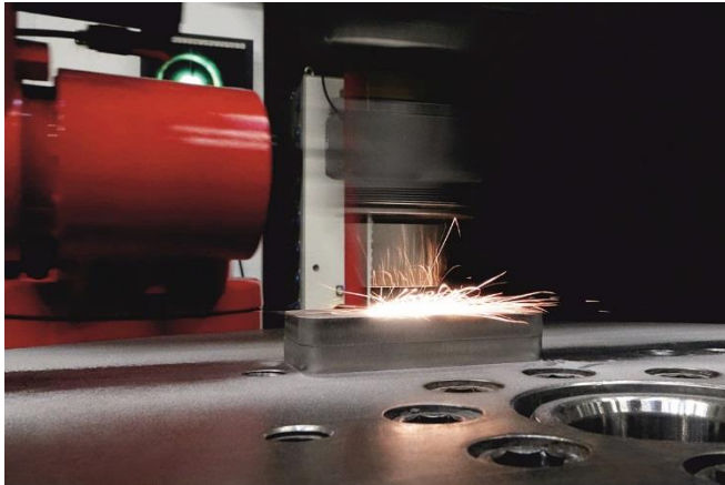
Image 3: Not only suitable for coating rotationally symmetrical components: The EHLA process is now being further developed for additive manufacturing of 3D geometries.

FRAUNHOFER INSTITUTE FOR LASER TECHNOLOGY ILT